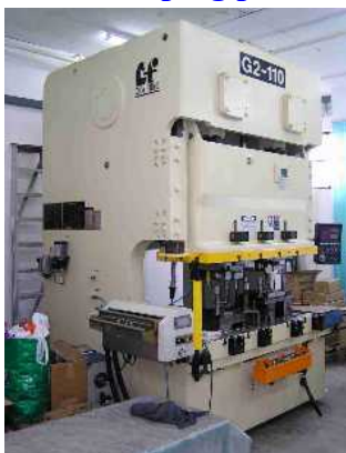
Chin Fong 110T Press