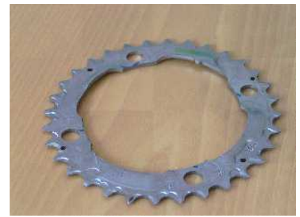
Bicycle Gear production

For more details on how you can benefit from our expertise, please call or email us.