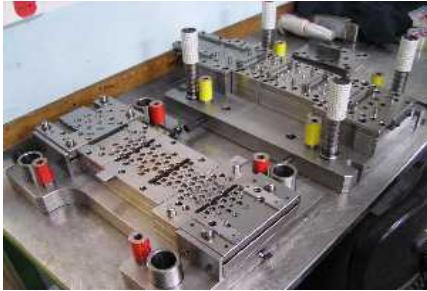
Battery Cap Progressive Die