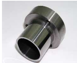
Precision Ground Parts