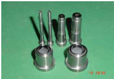
Precision Carbide Punches