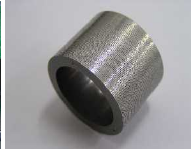
Motor Stacked Core Die Part