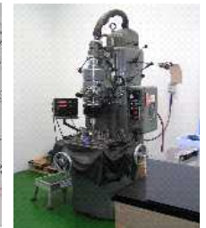
Moore JG m/c