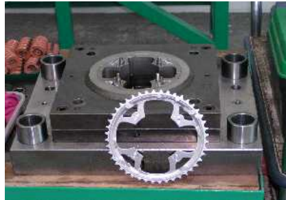
Bicycle Gear Trimming Die